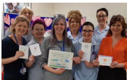
Bishop Auckland Hospital