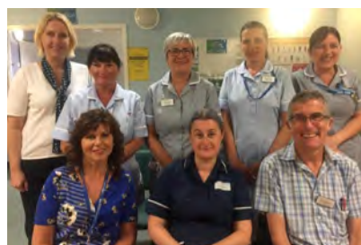
University Hospital of North Durham